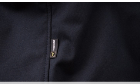
Adjustable waist strap with ThermSAFE hook and loop