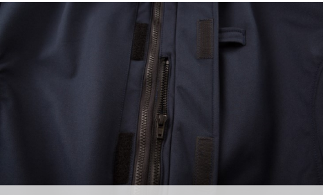
Napoleon chest pocket with phone pocket inside